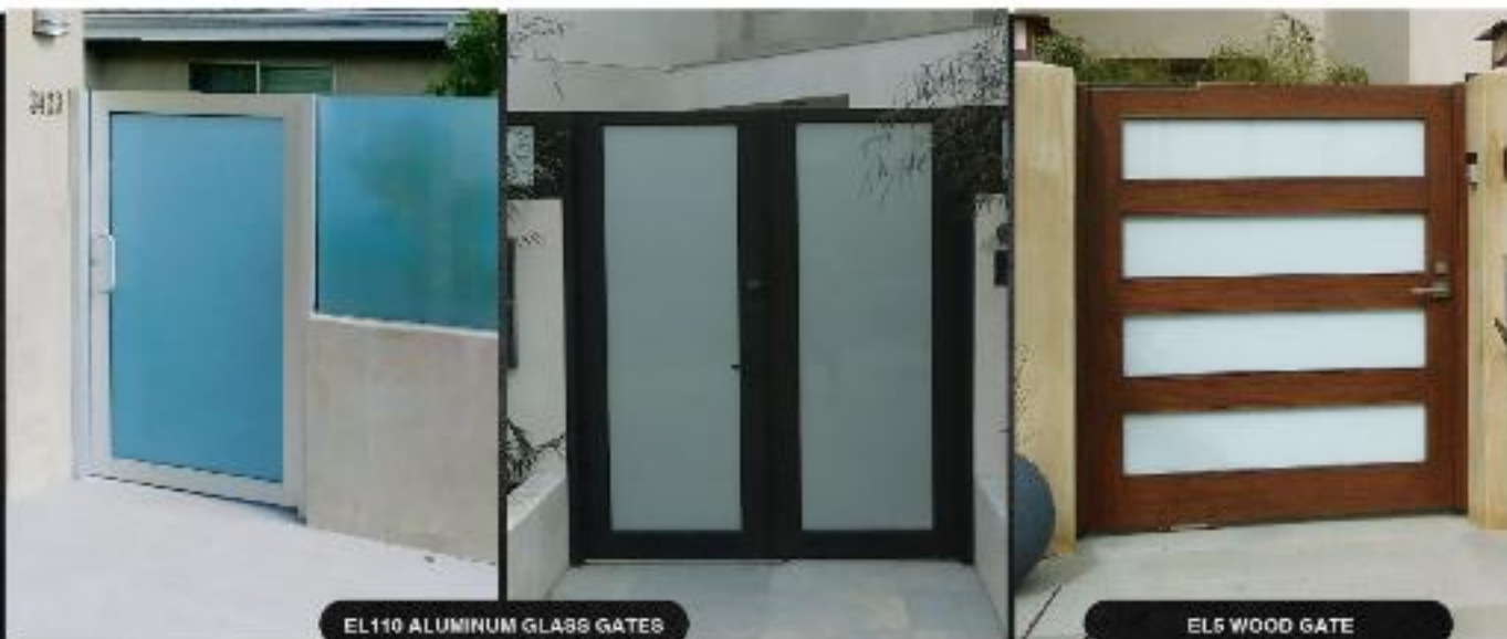
EL110 ALUMINUM GLASS GATES