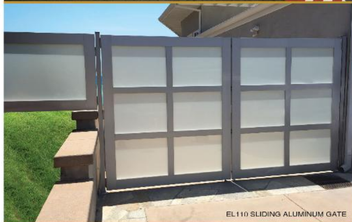
EL110 SLIDING ALUMINUM GATE

EL 110 Aluminum Glass Gates EL5 Wood Gates